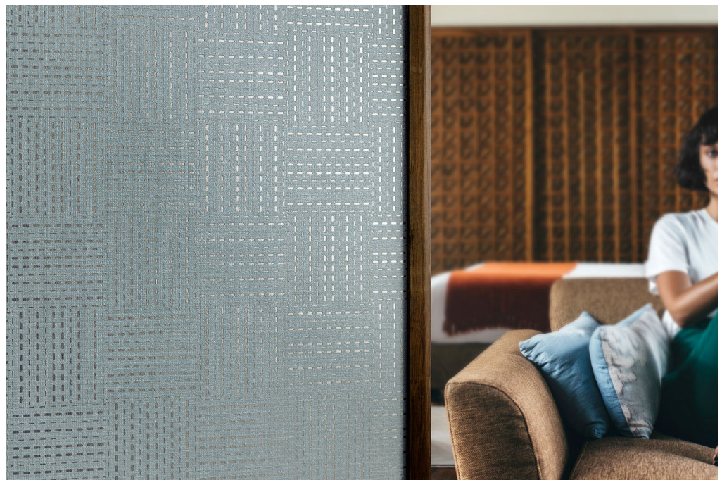
wallcovering – design Meshlin

Linen's organic origins are present in the plant-like patterns of Ivylin and Combolin , while Noblelin and Muralin expresses linen's heritage through the timeless, fashion-focused herringbone motif. Celebrating sophisticated modern treatments and techniques, patterns like Meshlin , Metalin and Ringolin add a luxurious layer that produces a dynamic sheen-versus-matte effect.