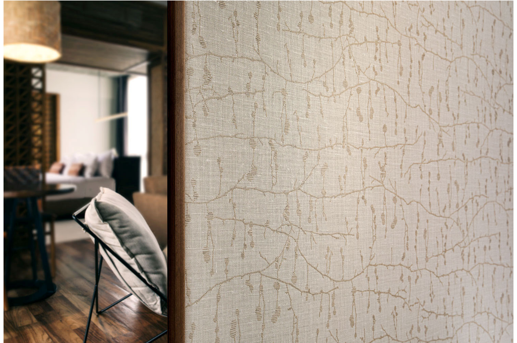
wallcovering – design Ivylin

Honouring the inherent natural beauty and diversity of linen, Vescom's linen wallcovering collection is carefully crafted, not over-designed, with 26 patterns that showcase a wide range of structures, yarns, effects and techniques.