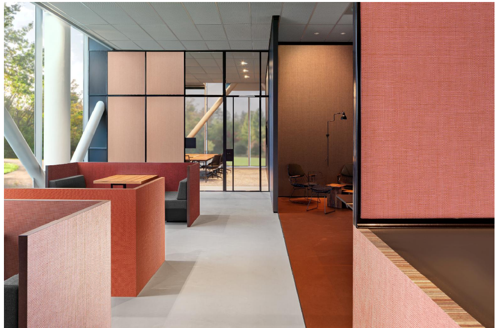
Xorel® textile wallcovering – design Meteor

A perfect basic, Meteor is a simple design woven from the thin polyethylene yarns that define the Xorel® product group and give the material its unmistakable luxurious lustre. In addition to its distinctive look, the high performance and low environmental impact of Meteor make it an unparalleled product for contemporary times. Certified Cradle to Cradle® Silver – an assurance of its circularity – it is incredibly strong, durable and long-lasting, and achieves the highest level of flame retardancy in the Xorel® range.