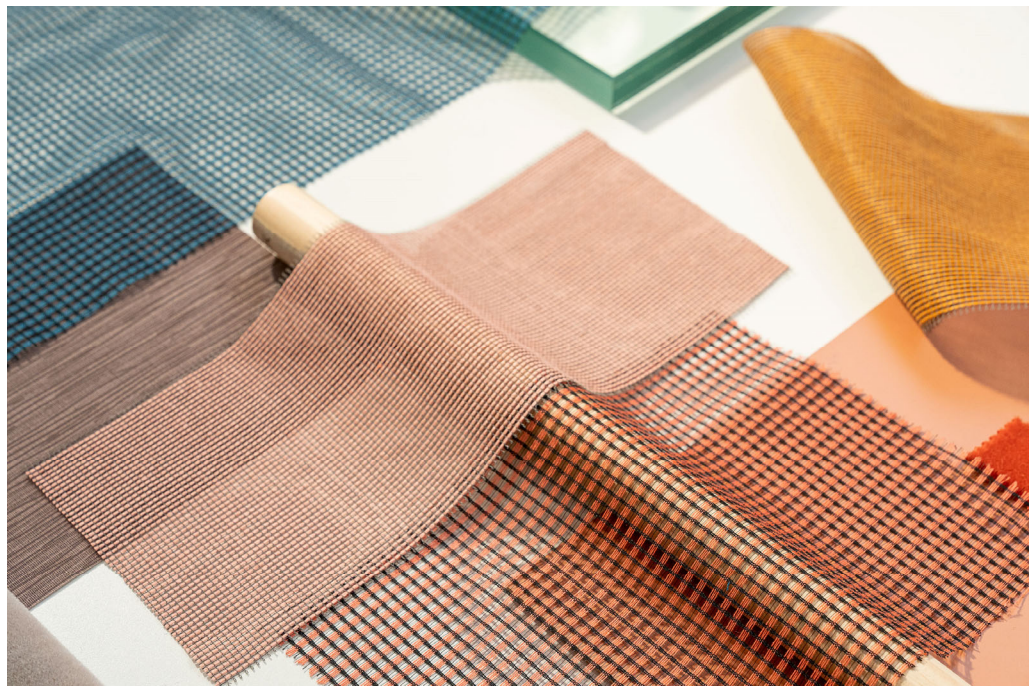
curtain – designs Teon & Nias

Made in Vescom's own weaving mill, Teon and Nias explore grids and scales. Nias features a small graphic weave structure, while Teon's oversized grid is a technical feat. These sheers allude to solid architectural structures yet are incredibly soft – like fluid walls more than conventional curtains – and their graphic lines create a dynamic lattice of light and shadow in today's spaces.