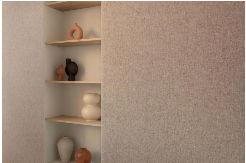
Textile Wallcovering – design Dale

Recalling the graphic rhythm of architectural grids, Rila is a sustainable 100% polyester wallcovering that includes 59% recycled content.