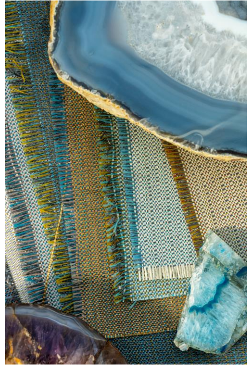
Textile Wallcovering – design Jewel