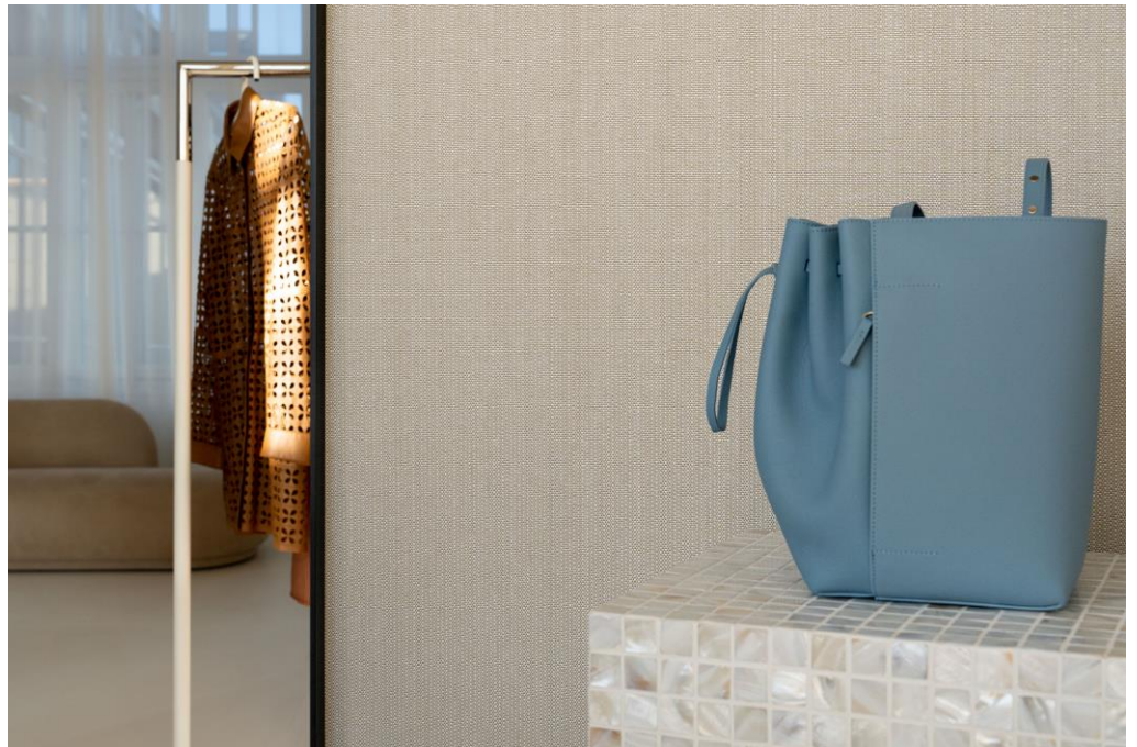
Textile Wallcovering – design Fraser

The entire offering is perfect for elevating today's high-end interiors – such as high-end hotels, restaurants, residences and boutiques – infusing them with rich materiality, tactility, character and comfort.