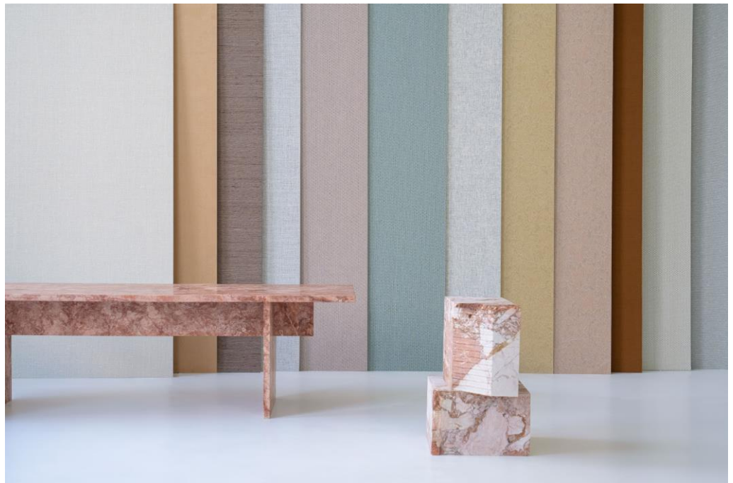
Textile Wallcovering – collection overview

Celebrating crafted materials, Vescom's new Textile Wallcovering collection highlights the wide scope of what luxury means today. The 10 designs explore how different approaches to woven wallcovering using various materials create different luxurious looks and feels. The collection responds to the unique inherent properties of each material – recycled wool, (recycled) polyester, linen, silk, wood pulp, polyethylene – resulting in a variety of textures, scales and finishes, from soft to structured, from minimalistic to bold, and from matte to shimmery.